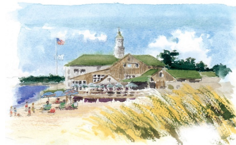
Oceanside at The Dunes Club • 137 Boston Neck Road

To purchase by mail or phone: Lise Desmarais: 401-421-0821 Lise@motheroflife.org