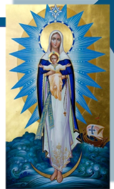
Our Lady, Star of the Sea Patroness of Rose Gala 2025

No paddle raise, but we will welcome your pledge!