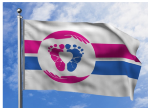
International flag of the pro-life crusade

A Cautionary Tale of the Readily Available Abortion Pill is an enlightening article by Jason Philips, M.D. ( cathmed.org/pulse/2023-spring ) which reveals the scope of devastation that must be prevented and treated. We must intervene.